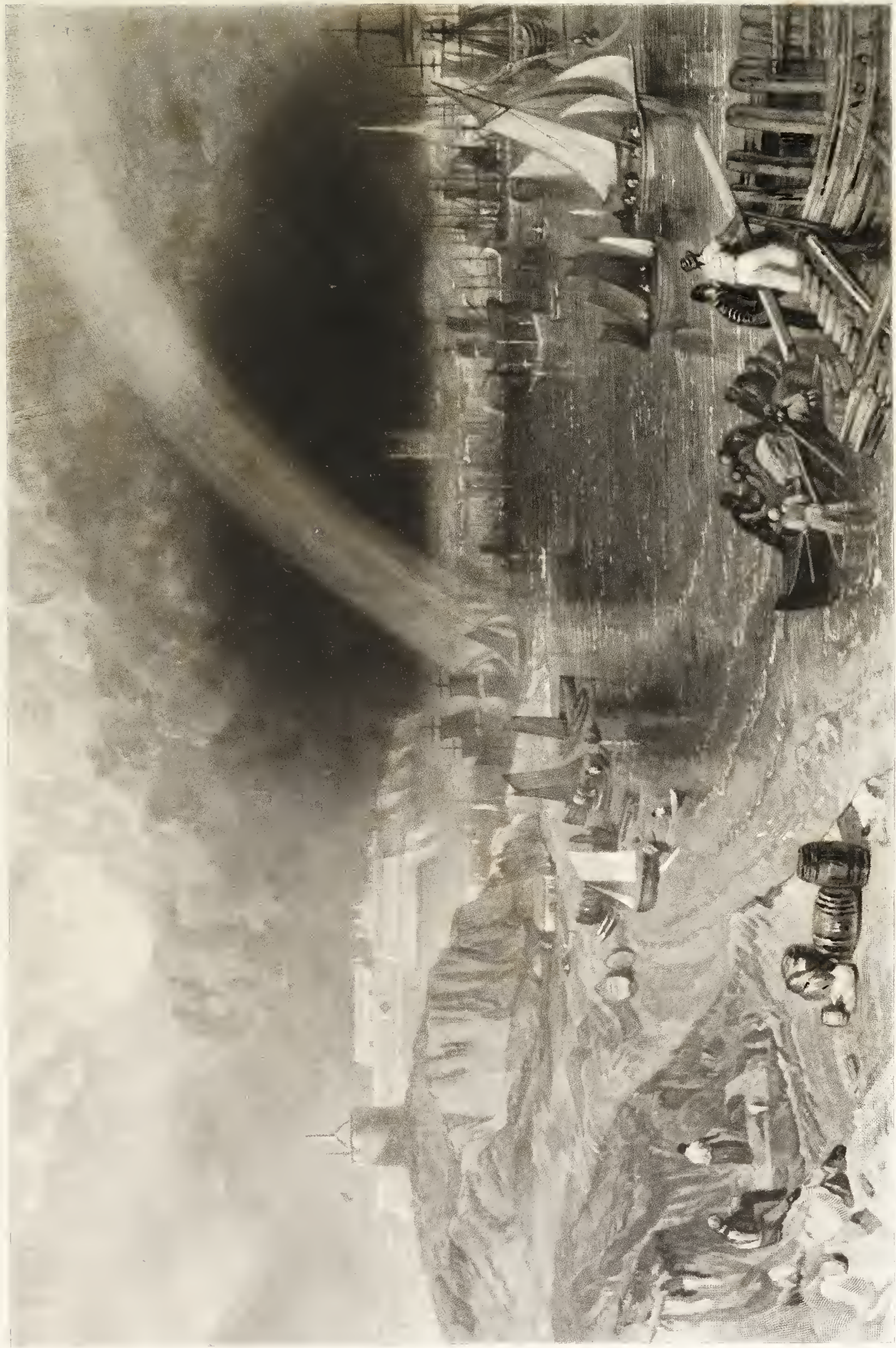
Engraved by Tho. Lupton